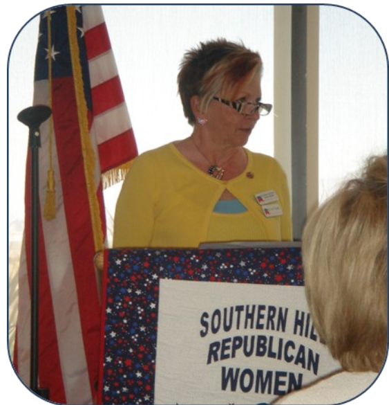
PICTURES FROM OUR APRIL LUNCHEON AND DARYLL ANN INTRODUCING DONALD TRUMP